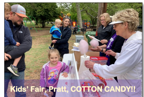
Kids' Fair, Pratt, COTTON CANDY!!