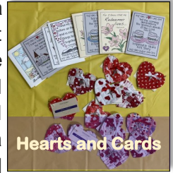
Hearts and Cards

The LWML WOMEN IN GOD'S SERVICE (WINGS) GROUP, IMMANUEL, HEPLER has had a busy Spring. They started the year with a project day in January, making quilted heart ornaments with a scripture card attached, that were used as table favors for the low-income housing groups' Valentines Day Party. They colored, wrote personal messages, and attached Bible verses to Valentine and Easter Cards that were distributed to the local assisted living facility. In February, 12 women of the congregation and 13 guests enjoyed a Saturday morning brunch, including the Bible study, The Women in Christ's Genealogy . April brought the LWML Kansas District Convention in Wichita; six members attended. Some of the convention attendees visited the Orphan Grain Train as their servant event and delivered items they had been collecting for donation. The group also assisted the Immanuel congregation with the LCMS Kansas District Faith at Work Initiative, including collecting food and funds for the local food pantry; collecting diapers, baby items, and funds for Vie Medical Center; and collecting personal care items for Immanuel's comfort station for cross country bicycle riders.