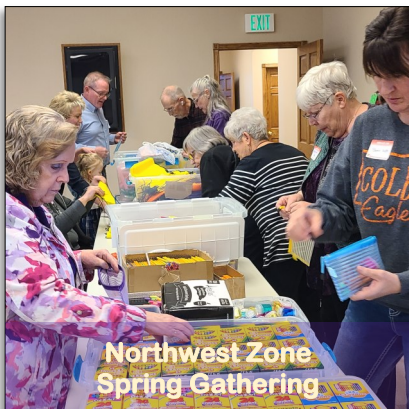
Northwest Zone Spring Gathering

Attendees of the NORTHWEST ZONE Spring Gathering, held at Immanuel, Norton, in March, assembled school supplies that will become part of a shoebox gift for Operation Christmas Child. In addition to school supplies, each shoebox, when fully assembled, will contain quality toys and personal care items along with the Gospel story booklet, The Greatest Gift , so each child can learn about Jesus and His love for them.