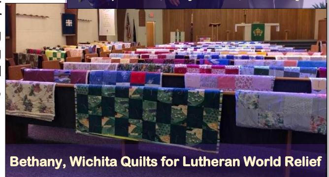
Bethany, Wichita Quilts for Lutheran World Relief